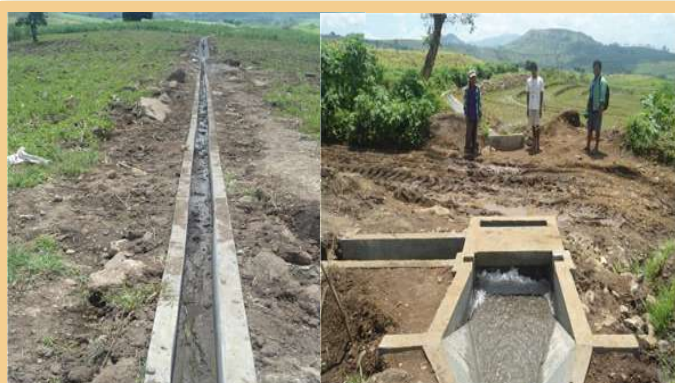
Completed Canal Lining and Structures, Pangantucan CIS, Bukidnon, Region 10

IRPEP is a multi agency Project with the Department of Agriculture as the Lead Agency with NIA, NFA, GMA Rice, BPI, BSWM and the different LGUs as key/support agencies. It is originally being implemented in Regions 8 and 10 covering 29 CISs in Leyte, Northern and Western Samar and 22 CISs in Bukidnon and Lanao del Norte respectively that will restore and rehabilitate a total area of 4,664 hectares.