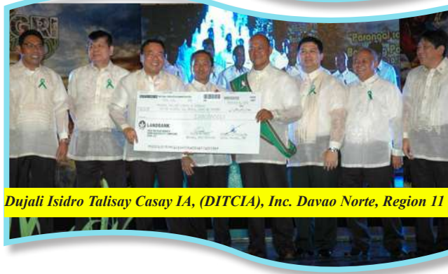
Dujali Isidro Talisay Casay IA, (DITCIA), Inc. Davao Norte, Region 11