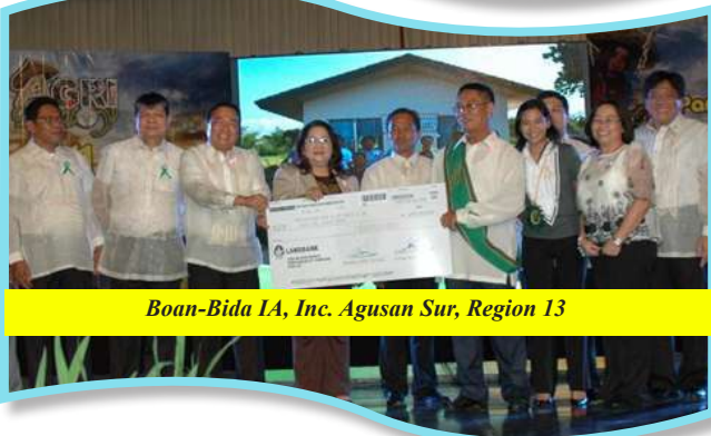
Boan-Bida IA, Inc. Agusan Sur, Region 13