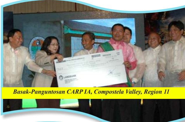
Basak-Panguntosan CARPIA, Compostela Valley, Region 11