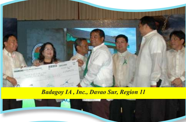
Badagoy IA, Inc., Davao Sur, Region 11