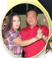
Dance with the Administrator

A time of loving and sharing... this is how NIAns celebrate the Heart's Day. #