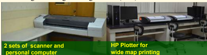
2 sets of scanner and personal computer

This major development supports the IEC thrust of upgrading parcellary maps of irrigation serviceable areas and managing of potential irrigable areas. #