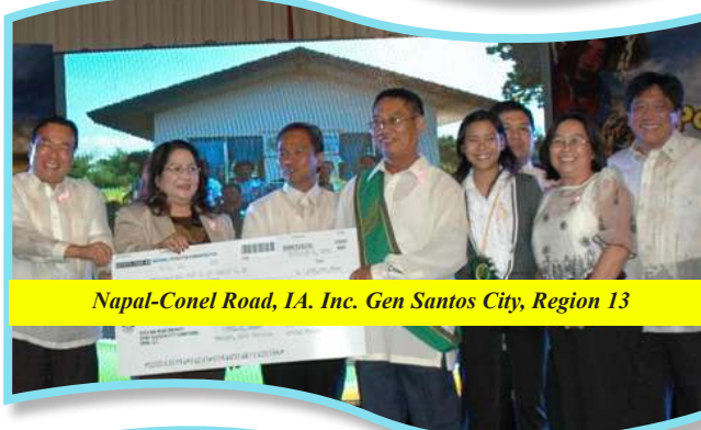
Napal-Conel Road, IA, Inc. Gen Santos City, Region 13