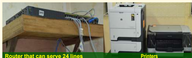
Router that can serve 24 lines

The DA has tasked the Information Technology Center for Agriculture and Fisheries (ITCAF) to manage said data. With the purpose of implementing the UEGIS and establishing a laboratory, line bureaus and selected attached agencies were provided with RS-GIS equipment and software. Consequently, an RS-GIS laboratory was established at the NIA-Irrigation Engineering Center (IEC).