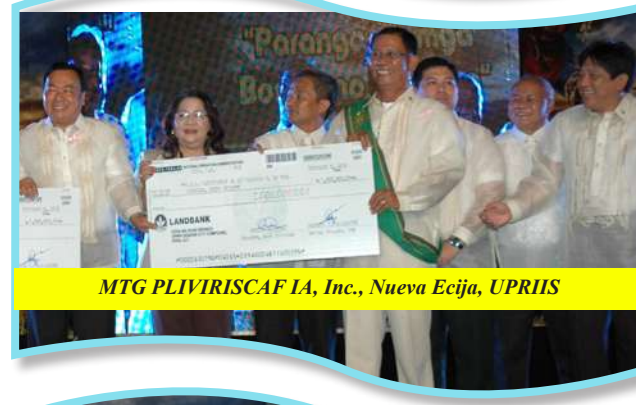
MTG PLIVIRISCAF IA, Inc., Nueva Ecija, UPRIIS