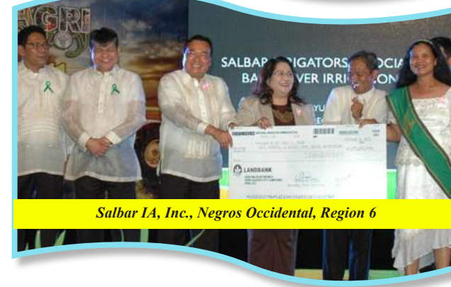
Salbar IA, Inc., Negros Occidental, Region 6