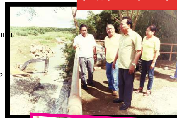
STRAIGHT FROM THE TOP

"Itataas namin kayo, itataas niyo rin kami," was the message he left with the farmers.