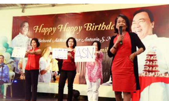
HRD doing their part