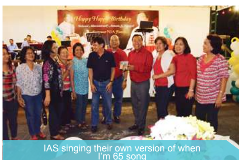
IAS singing their own version of when I'm 65 song