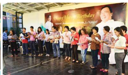
PIDP renders a Poem to Adm. ASN