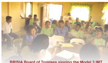
BRISIA Board of Trustees signing the Model 3 IMT Contract witnessed by NIA Laguna-Rizal IMO Institutional personnel.