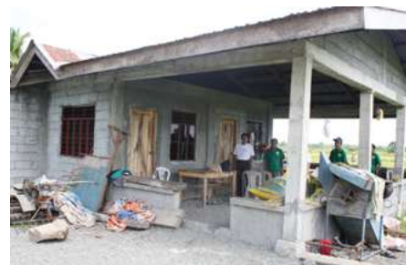
On-going construction of Calamundingan IA Office

With the hope and compassion of providing better services to co-farmers, Calamundingan IA is geared towards continuous sustainability.