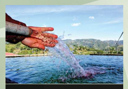
Irrigation water now flows abundantly to this more than two-decade old reservoir after the rehabilitation of Elengan CIS. In background shows part of the vegetable area serviced by the irrigation system.

This was the statement of Benguet Governor Nestor Fongwan during the Inauguration and Turnover of the Elengan Communal Irrigation System in Brgy. Bangao, Buguias, Benguet on January 9.