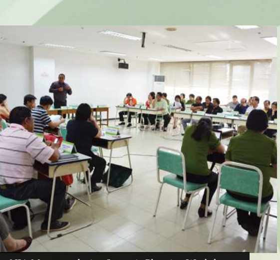
NIA Managers during Strategic Planning Workshop

This brings to mind that sometimes, winning does not solely lie on accomplishments. Other times, such as the case of MICAVICE IA, it's in the attitude! #