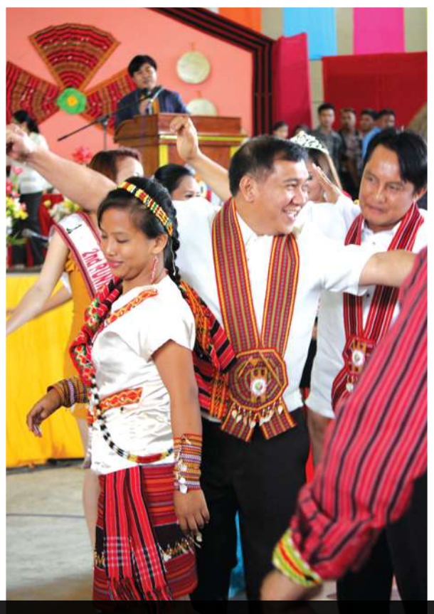
NIA Administrator joins Kalinga officials in a Kalinga dance.